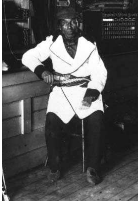
Metis man wearing capote and sash. Archives of Manitoba, Rackham, William 190 (N12891)

Cheryl Troupe gives us an explanation of sash construction: