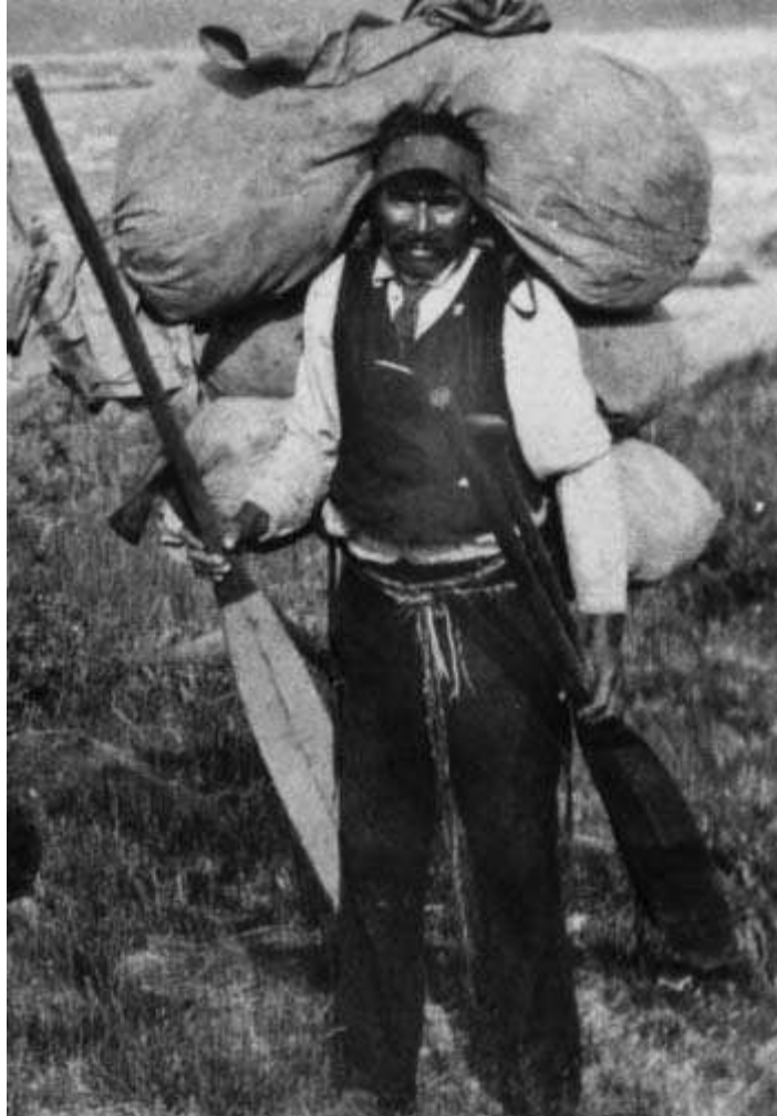
Close-up of a Metis York-boatman on a Nelson River portage in 1910